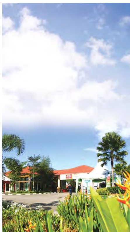
Seri Austin Sales Gallery

Protecting and sustaining the environment is a major part in UMLand Berhad's Corporate Social Responsibility agenda and this is evident in the 'Green Living' campaign launched in Seri Austin. This indicates our pledge and commitment as a responsible developer to the customers, the public and the environment.