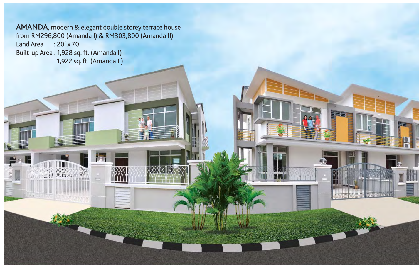
AMANDA , modern & elegant double storey terrace house from RM296,800 (Amanda I) & RM303,800 (Amanda II) Land Area : 20' x 70' Built-up Area : 1,928 sq. ft. (Amanda I) 1,922 sq. ft. (Amanda II)