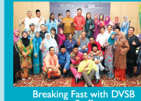
Breaking Fast with DVSB Staff