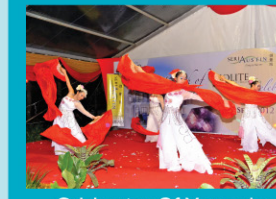
Celebration Of Mooncake Festival