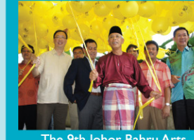
The 9th Johor Bahru Arts Festival 2012