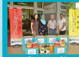
Contribution Of Hari Raya Hampers