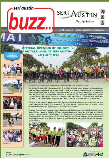
Previous issue Volume 9

Important Contact Nos. Seri Austin Sales Gallery : 07-354 1111 Police Hotline : 07-225 6699 : 07-225 4688 Rakan Cop Hotline : 07-221 2999 Police Helpline : 07-223 2222 : 07-223 2223 : 07-223 2224 : 07-355 5444 Fire & Rescue : 07-224 4346 Hospital Sultanah Aminah : 07-223 1666 Hospital Sultan Ismail : 07-356 5000 Johor Specialist Hospital : 07-225 3000 Senai Airport : 07-599 4500 KTM Railway Station : 07-223 3040 : 07-223 4727 North-South Expressway : 1800-88-0000 CIQ : 1800-88-8855