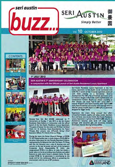
Previous issue Volume 10