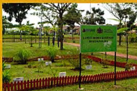
RTM's Visit to Seri Austin