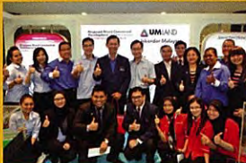
Johor Bahru Transformation Open Day