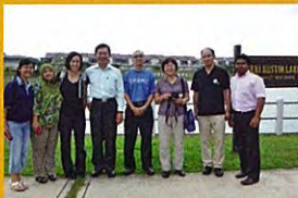
EM Seikatsu Japan & EMRO visit to Seri Austin EM Workshop