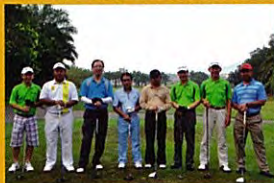
UMLand-TNB-Maybank Golf Challenge