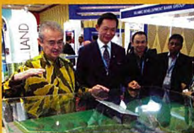
8 th World Islamic Economic Forum