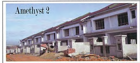
Amethyst 2 Double Storey Terrace (22' x 75') 2,062 sq.ft. | Work In Progress (%) 74.26%