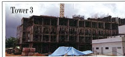
Tower 3 Residency Apartment | Work In Progress (%) 24.64%