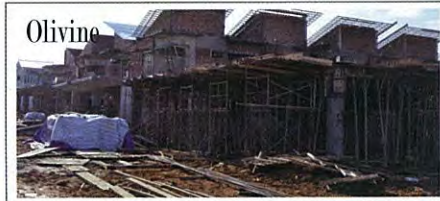
Olivine Double Storey Cluster 2 (32' x 75') 2,764 sq.ft. | Work In Progress (%) 55.35%