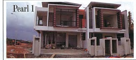
Pearl 1 Double Storey Terrace (26' x 80') 2,588 sq.ft. | Work In Progress (%) 80.07%