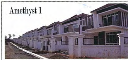
Amethyst 1 Double Storey Terrace (22' x 75') 2,013 sq.ft. | Work In Progress (%) 96.62%