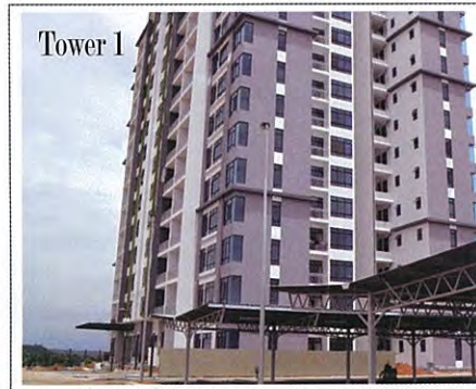
Tower 1 Residency Apartment | Work In Progress (%) 96.86%