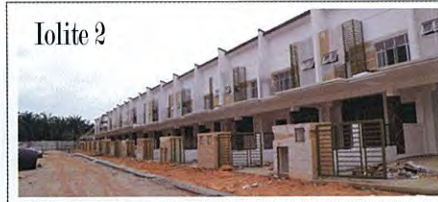
Iolite 2 Double Storey Terrace (20' x 70') 2,027 sq.ft. | Work In Progress (%) 73.14%