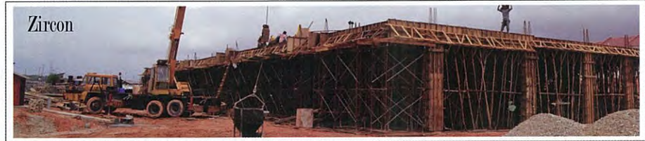
Zircon Shop Lot Shop Lot (24' x 80') 5,699 sq.ft. | Work In Progress (%) 30.35%