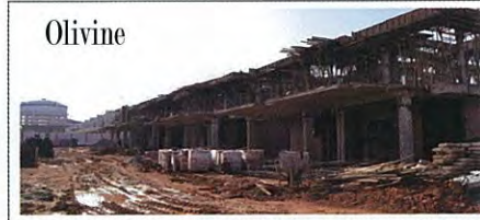
Olivine Double Storey Semi Detached (35' x 90') 3,067 sq.ft. | Work In Progress (%) 60.10%