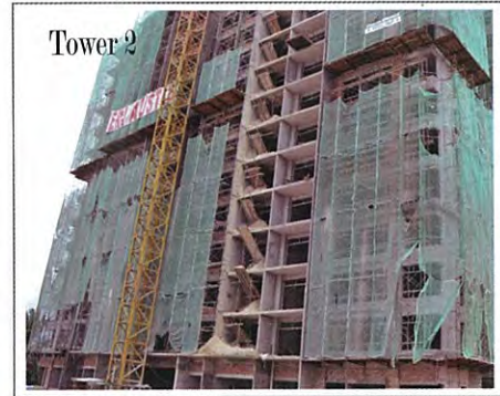
Tower 2 Residency Apartment | Work In Progress (%) 62.00%