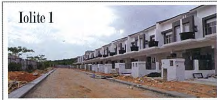
Iolite 1 Double Storey Terrace (20' x 70') 1,949 sq.ft. | Work In Progress (%) 94.09%