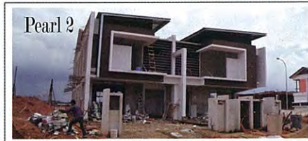
Pearl 2 Double Storey Terrace (24' x 80') 2,473 sq.ft. | Work In Progress (%) 80.07%