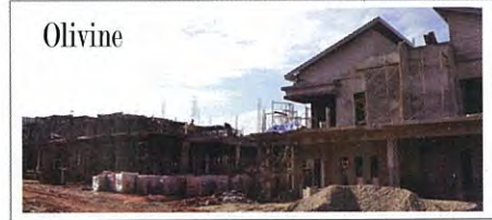
Olivine Double Storey Cluster 1 (35' x 75') 2,669 sq.ft. | Work In Progress (%) 52.50%