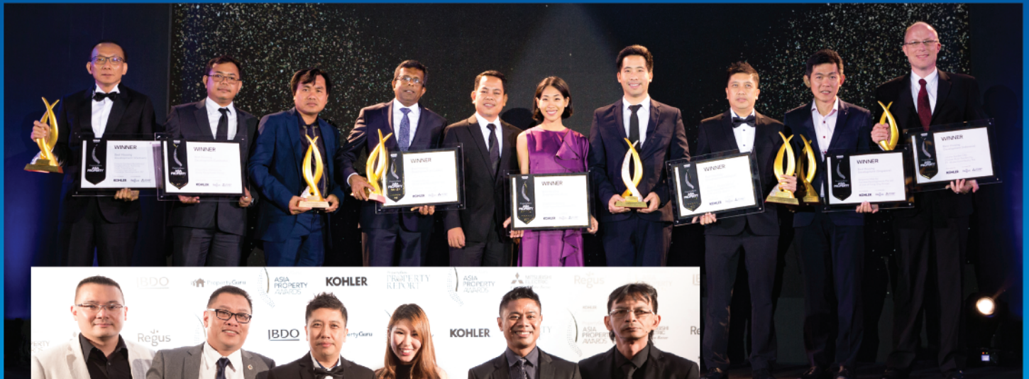
7 November 2017 - UMLand Seri Austin has bagged The "Best Housing Development (Malaysia) for Aster 2 - Double Storey Semi-Detached House" Award at the Asia Property Awards (Singapore) 2017 Grand Final which took place on 7 November 2017 at Sands Expo and Convention Centre, Marina Bay Sands, Singapore.