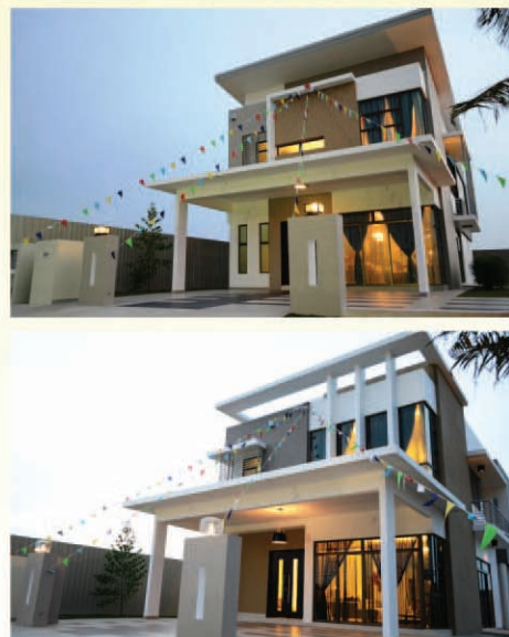
Ametrine Double Storey Bungalow