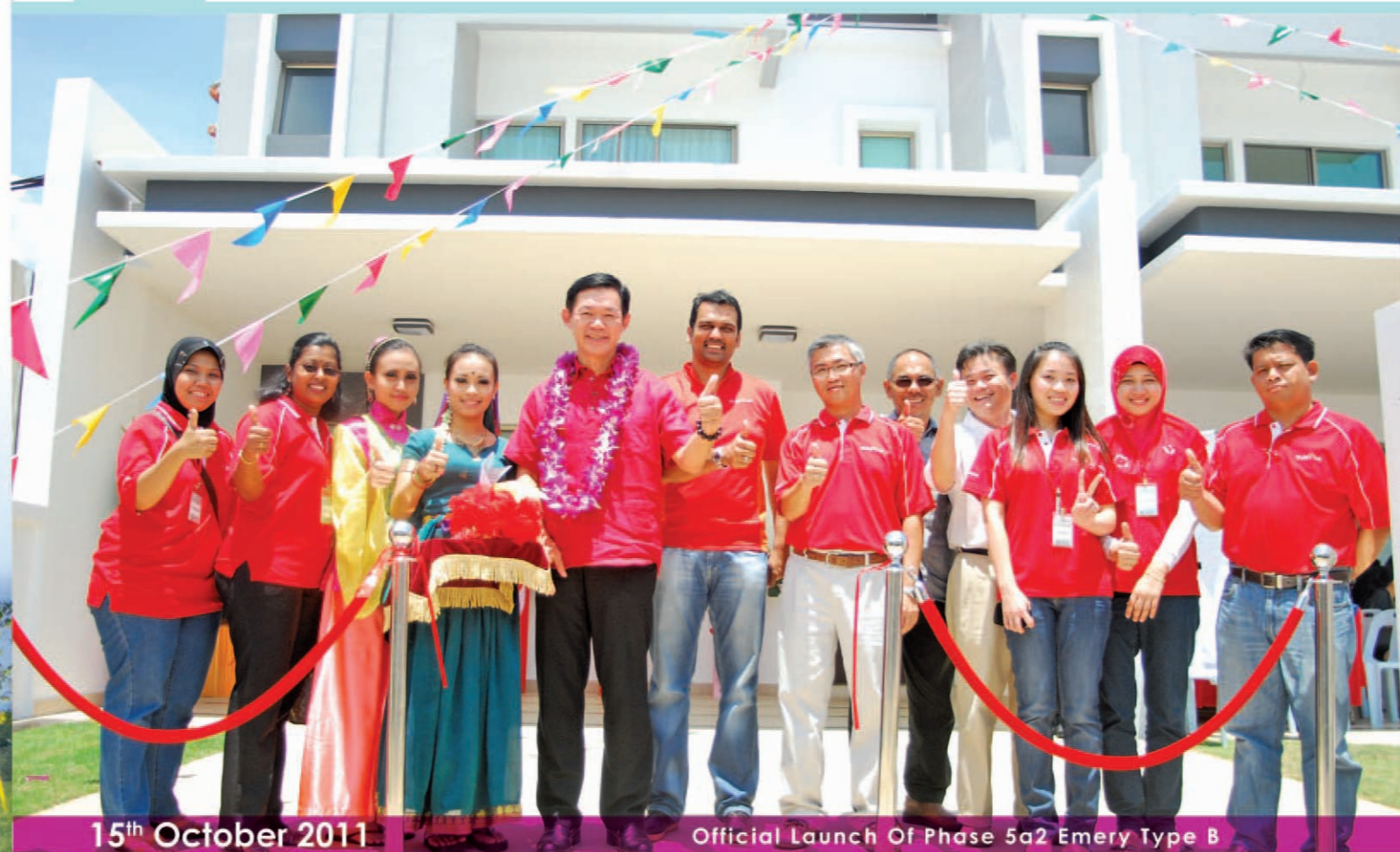
15 th October 2011 Official Launch Of Phase 5a2 Emery Type B