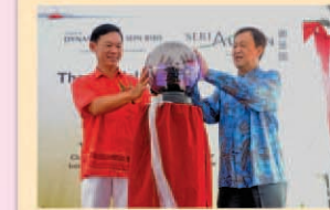
Official Launch of Citrine