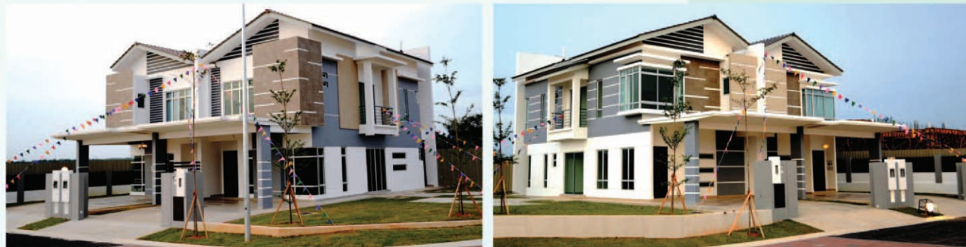
Citrine Double Storey Cluster House