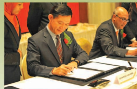
The 2 nd Signing Ceremony of High Speed Broadband Services

Both TM and DVSB are committed to leverage on their core competencies and strengths in providing quality eco-friendly homes as well as HSBB network infrastructure that supports UniFi services. Residents can now truly enjoy a digital lifestyle brought about via high speed broadband connectivity. This event has given Seri Austin extra mileage and awareness as a smart township with community connectivity.