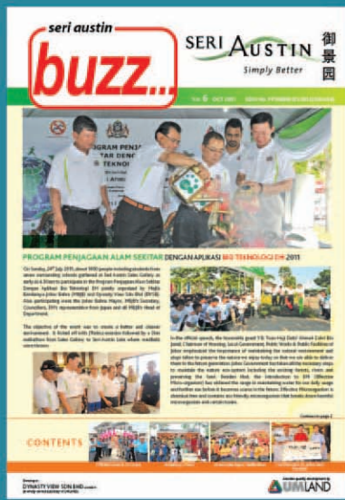
Previous Issue Volume 6