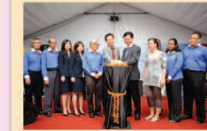
Official Launch of Ametrine