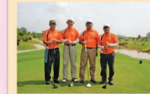
Seri Austin Golf Invitation 2011